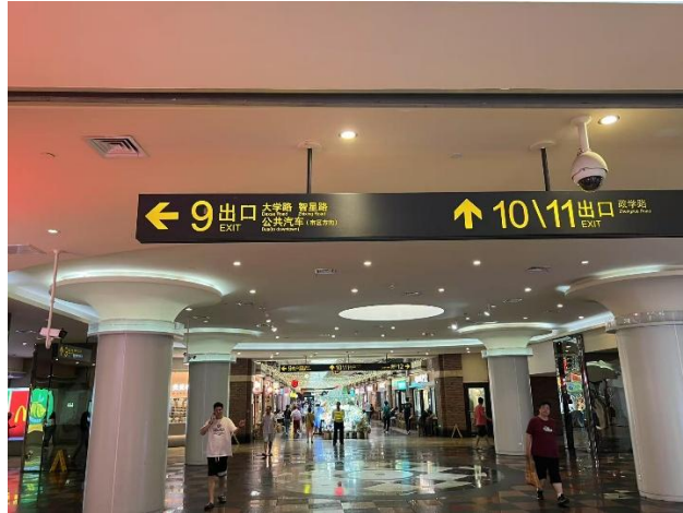
Exit at Exit 9